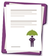
Life insurance, annuities