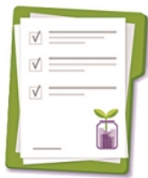
IRAs, 401(k)s, 403(b)s