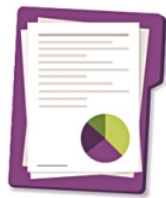
Investment or brokerage accounts, CDs